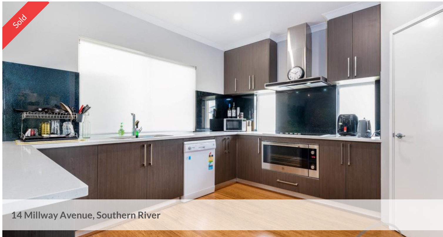
14 Millway Avenue, Southern River