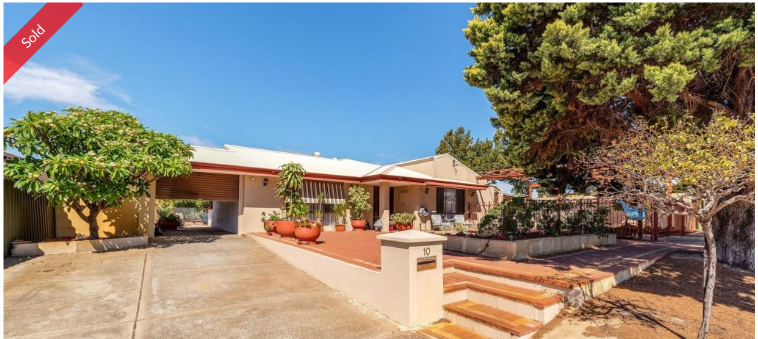
10 Saffron Court, Riverton