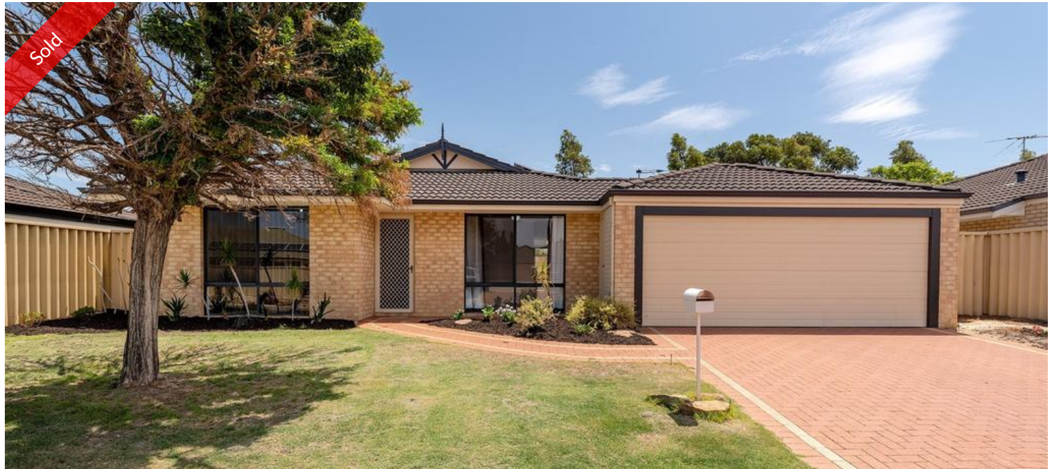
10 Seddon Way, Canning Vale